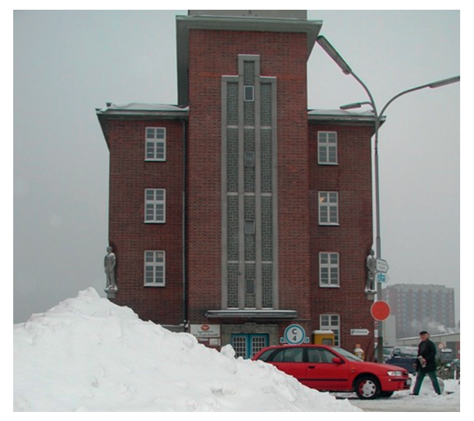
Fig. 7. First premises of the GEOMAR Research Center for Marine Geosciences at the CAU in the area of the old fish market ("Seefischmarkt") on the eastern shore of "Kieler Förde". The first GEOMAR offices were established in the pictured building no. 4.

paleoclimatic research (Hay, 2016). He had been involved in the ocean drilling programs since their inception and had served on a number of JOIDES Panels and its Planning and Executive Committee for the DSDP and IPOD.