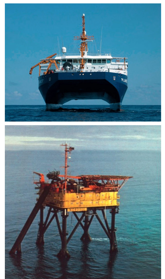
Fig. 11b. The second RV PLANET of FWG, launched in 2004.