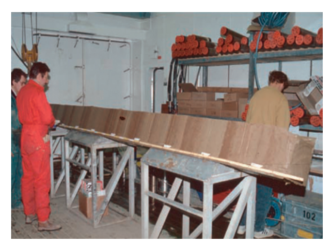
Fig. 6. "Kastenlot" from the central Arctic Ocean and acquired by research vessel POLARSTERN (long and large volume box corer developed by the marine geology group of GPI).

The scientific thrust of the marine geology group at the GPI changed considerably during the late 1960s and early 1970s. Attention turned to the continental margins off Western Europe and Northwest Africa and various deepsea basins, as well as to marine non-living resources (von Rad et al., 1982). A number of METEOR expeditions were organized to study sedimentation patterns and processes along profiles across the shelves and adjacent slope regions, primarily off the Iberian Peninsula and Northwest Africa. Again, geophysical data and sediment distributions were investigated relating them