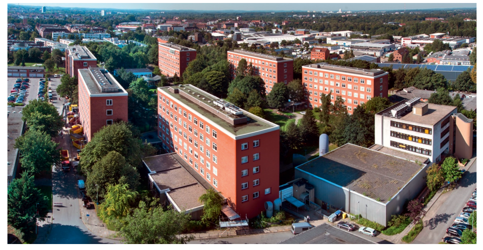
Fig. 3b. Picture of the "Angerbauten" in the Ludewig-Meyn-Strasse of the CAU campus which had been built in the mid-sixties, but which will be demolished in the near future because of constructional deficiencies. The new GPI (from 1967 onwards) as part of the "Angerbauten" is located on the far left corner of this group of buildings. The art of building was modest at that time with the result that a decision has been reached in 2015 to demolish it and to plan for a new building, also as part of the CAU campus, but at some distance to this location.

One of the other relatively early investments was the development of a sophisticated sediment balance by Eckart Walger to measure hydraulic grain sizes and of a flume channel (installed in the new building) soon used for experiments on the erodibility of sediment surfaces (cf. paragraphs on SFB 95 further below; Einsele et al., 1974). Another example of the introduction of new techniques was the preparation of radiographs of well-prepared sediment slices collected from the large volume box cores which allowed to study mechanical and biogenic sediment structures in great detail. This ac-