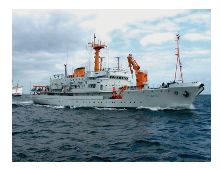
Fig. 11a. The first RV PLANET of FWG, launched in 1967.

The FWG soon gained national and international reputation because of its sophisticated scientific and technical structure. In 2004, its original research vessel PLANET which had been launched in 1967 was replaced by a highly advanced new PLANET. The new ship is a large twin hull vessel with very quiet seagoing properties up to high sea states. Both vessels (figs. 11a–b) operated in the Baltic and North Seas as well as in the North Atlantic and Mediterra-