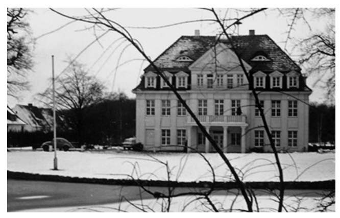
Fig. 2. The old "mansion" in Stift which housed working groups on marine micropaleontology for many years, until the new GPI was built on the university campus 1964–1966 (cf. Figs 3a–b).

disciplines through existing staff, thereby maintaining the scientific breadth of the institute. Seibold also became the first dean of the newly founded Faculty of Natural Sciences (1963) of CAU, no small achievement after he had arrived in Kiel only five years before.