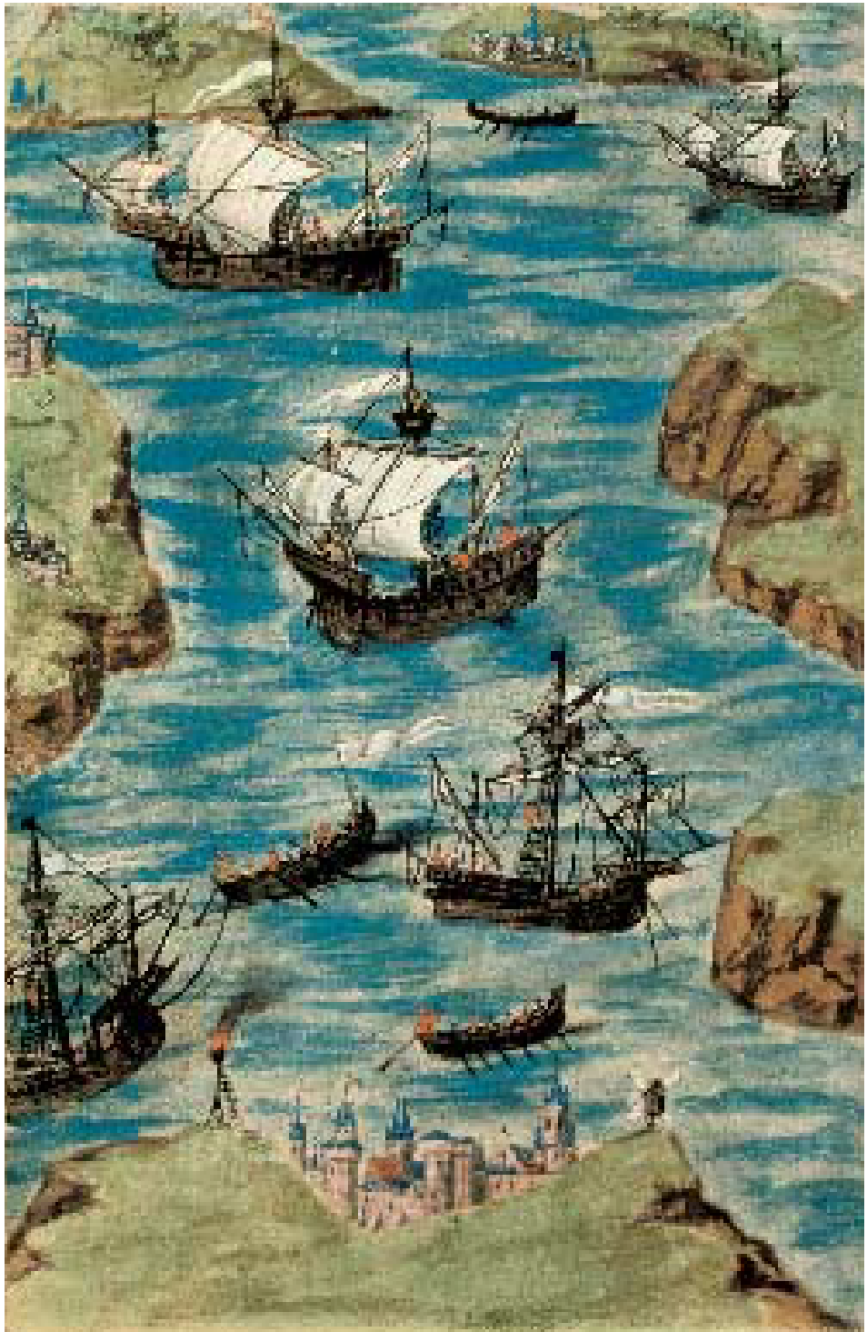
Ill. 1 Ships in an anchorage. (New York, Pierpont Morgan Library, Hastings MS 775, f. 130v)