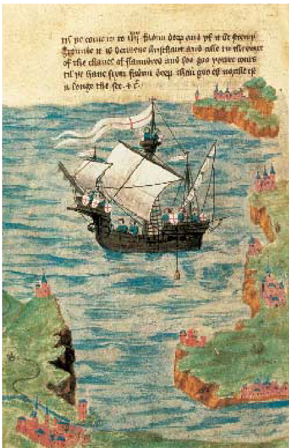
Ill. 2 Ships taking soundings off an unidentified coast. (New York, Pierpont Morgan Library, Hastings MS 775, f. 138v)