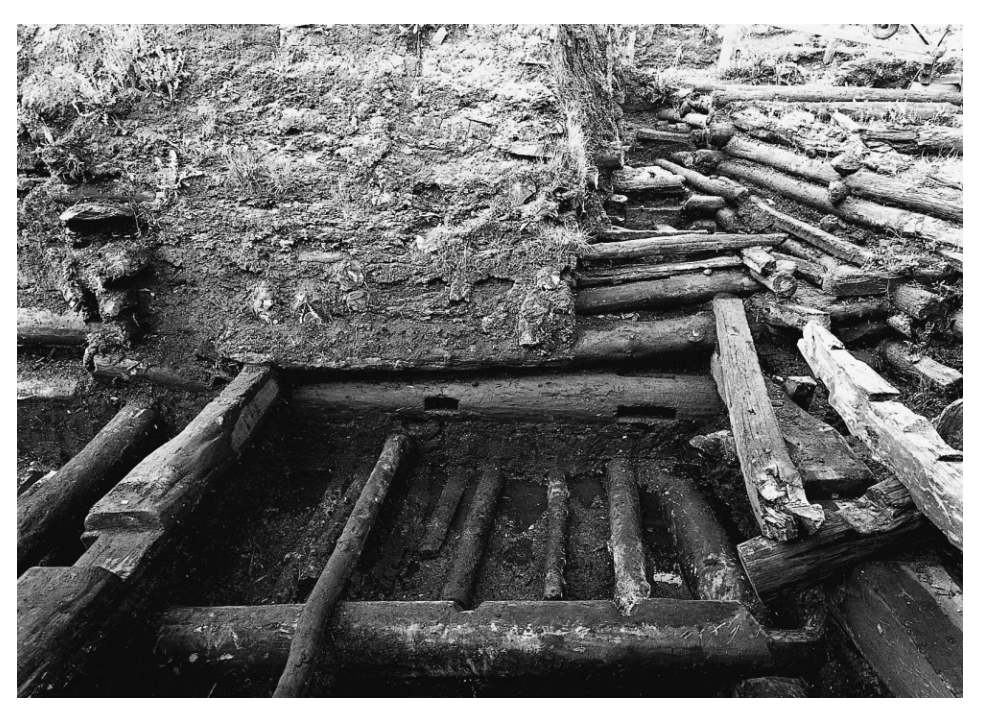
Fig. 1 Big Ship fragments in situ. One of the mast beams is seen on the left, the windlass in the middle and part of the keelson on the right.

The keelson is preserved in two pieces, originally treenailed together. The full length is 12.5 m (Fig. 2). The keelson is shaped on the lower and upper side for floor timbers and low-set crossbeams. The outer ends of the crossbeams are notched for clinker strakes. Two especially sturdy crossbeams form the mast step. A couple of futtocks, two sharp floor timbers from the end of the ship and a huge windlass drum were reused, as were two crossbeams with heads, small fragments of planking and a few more fragments of the framing, damaged to various degrees in the process of reuse. All fragments are of pine. The cross section of the ship at the mast, shown in Fig. 3, is based on the crossbeam in front of the mast, a floor timber exhibiting a good fit beneath the crossbeam and keelson as well as a sensible curve up from the crossbeam, with support in the two futtocks found. The beam at the sheer strake will then have been about 9 m in length. With a beam/height ratio of 2:1 we can postulate a total depth from the sheer strake to the underside of the keel at approx. 4.2 to 4.5 m. The principle of low-set crossbeams over short floor timbers and especially strong beams forming the mast step is known from other, smaller wrecks from the Early and High Middle Ages; Lynæs, Sjøvollen, Elling Å and Galtabäck (Englert 2000, Christensen 1968, Crumlin-Pedersen 1991, Humbla 1937, Åkerlund 1943 & 1948).