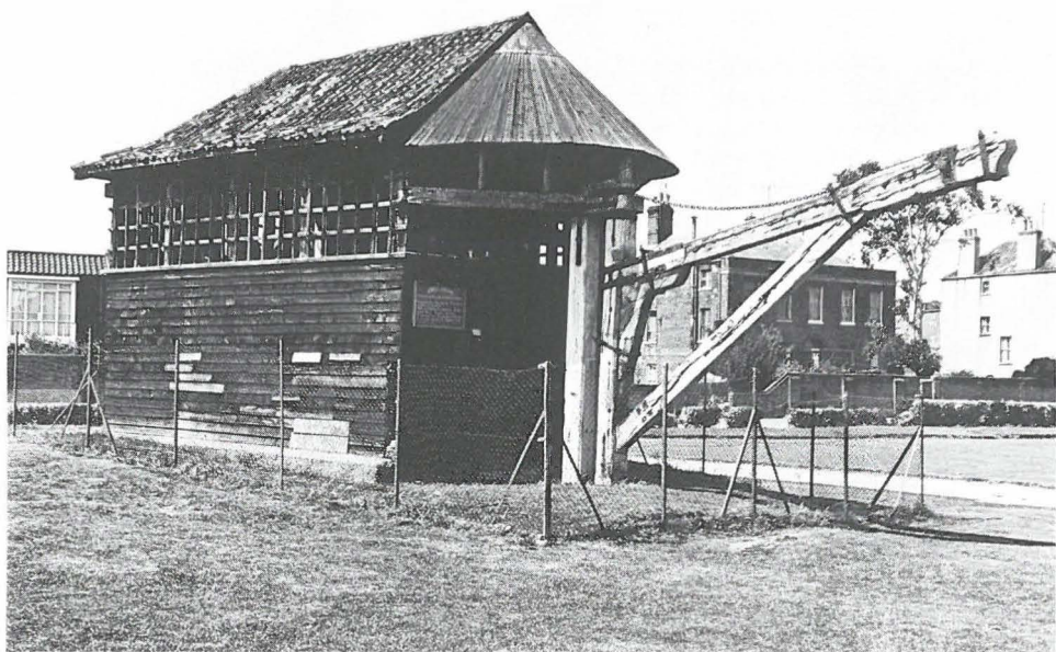
Fig. 1 The Harwich Crane, in its present position. The wooden latticing, the roof tiles and the semi-circular shelter for the crane head are all later additions.

"The Wardens receive of Mr. Edward Lambard of Brittlesea to ye townes use for ye craine Mr. Lambard did receive at ye hands of ye towneship at ye command of ye Queenes Mat ys " 2